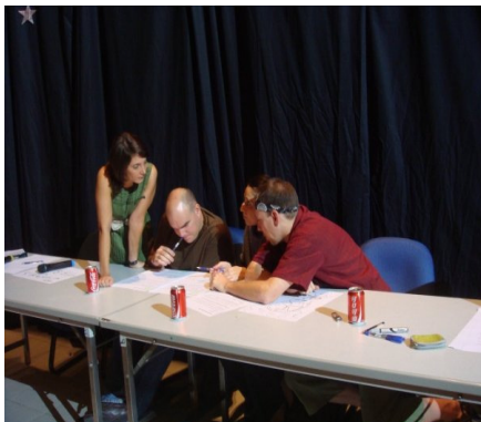
The judges decide

TABITHA is a charity that provides decent housing for the rural poor in Cambodia, one of the poorest countries in Asia. In addition, they provide micro-credit and employment opportunities that allow people to earn money and stay with their families in the countryside, thereby holding these communities together. The IB students have been involved with this charity for a number of years now and make an annual journey to Cambodia to build the houses that the money buys. This year, when the H3's go in June they aim to beat last year's record build of 15 houses by erecting 20 homes in two days!